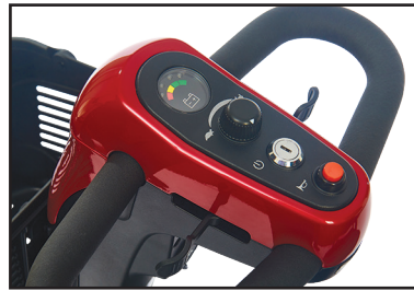
1. An Infinite Adjustable Tiller (no knuckle) at your fingertips!

Literature is current at time of printing. Golden Technologies reserves the right to make changes to the product or literature at any time.