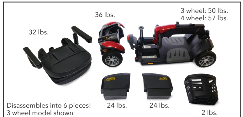
Disassembles into 6 pieces! 3 wheel model shown