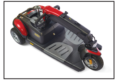
2. The tiller folds easily and locks in place.