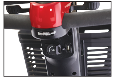
4. USB & Battery Charging Ports conveniently located on the tiller under the control panel.